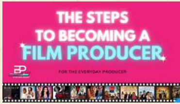
1. The Steps to Becoming a Film Producer with Angela White